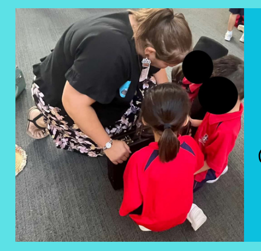
At the end, you will sit on the mat to talk about what you learned.