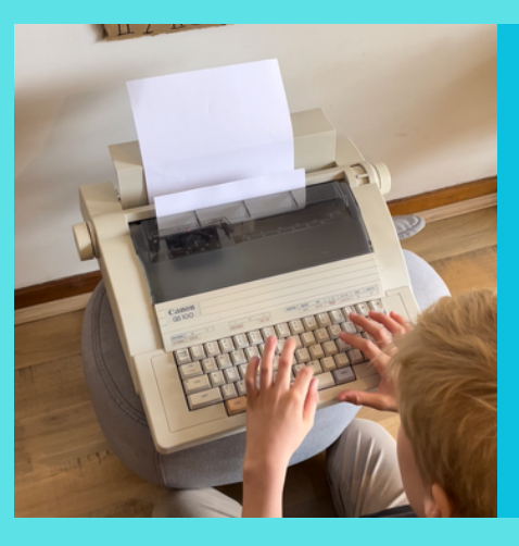
Then you will return to your usual daily routine.